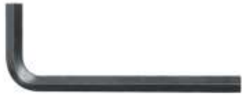
7/32" Allen Wrench

Tools Required: This list is the recommended tools for ease of installation. Other versions of the same tool can be used. For example, Allen Wrenches instead of Allen Drive Sockets.