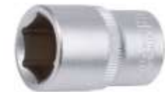
3/4" Socket & Ratchet