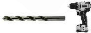
17/32" Drill Bit