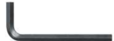
3/16" Allen Wrench