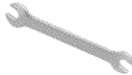
13MM Wrench 16MM Wrench

HOW TO USE THIS GUIDE: The installation guide contains ALL steps for installation. Please read and follow the instructions in order of each page top to bottom, and left to right.