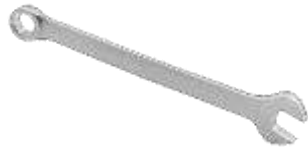
18mm Wrench 19mm Wrench

HOW TO USE THIS GUIDE: The installation guide contains ALL steps for installation. Please read and follow the instructions in order of each page top to bottom, and left to right.