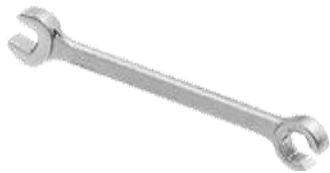
1-5/16" Wrench or Large Adjustable Wrench

Tools Required: This list is the recommended tools for ease of installation. Other versions of the same tool can be used. For example, Allen Wrenches instead of Allen Drive Sockets.