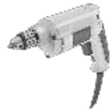
Electric Drill 1/8" up to 3/8" Drill Bits

HOW TO USE THIS GUIDE: The installation guide contains ALL steps for installation. Please read and follow the instructions in order of each page top to bottom and left to right.