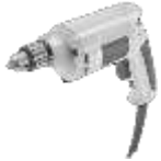
Drill ( Optional )