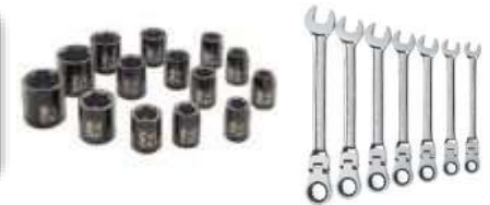
Set of SAE & Metric Sockets & Wrenches

HOW TO USE THIS GUIDE: The installation guide contains ALL steps for installation. Please read and follow the instructions in order of each page top to bottom, and left to right.