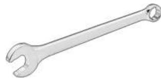
9/16" Box Wrenches

HOW TO USE THIS GUIDE: The installation guide contains ALL steps for installation. Please read and follow the instructions in order of each page top to bottom, and left to right.